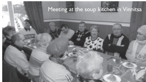
Meeting at the soup kitchen in Vinnitsa

The next place in our trip to Ukraine Vinnitsa where we visited the soup kitchen, together with our friends from the "Petach Tikvah" ministry in Holland. We were also at a Shabbat meeting which took place as part of the project "Synagogue". At this meeting we could together share the Word of God.