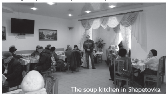
The soup kitchen in Shepetovka

First we visited Shepetovka where we were able to spend time at the soup kitchen and give testimony to the salvation that's available in the Messiah of Israel, Yeshua, Who can cleanse every person from their sins. After lunch several people asked us for intercessory prayer. It gave us another opportunity to give testimony of the salvation in the Messiah Yeshua Who said; "Come to me, all you who are weary and burdened, and I will give you rest" (Mt. 11:28).