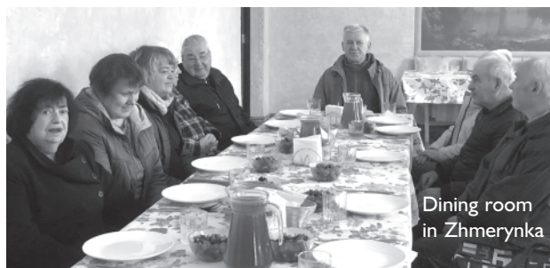
Dining room in Zhmerynka