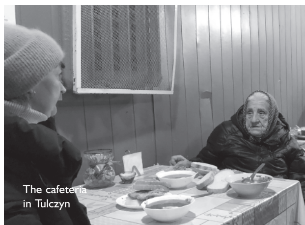
The cafeteria in Tulczyn