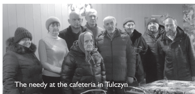
The needy at the cafeteria in Tulczyn

In Tulczyn, we visited some people whose needs we support. Among these people was 87-